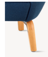
Solid Oak legs