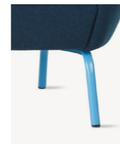
RAL powder coated legs NaughtOne Colours