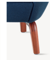
Solid Walnut legs