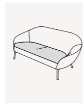
Two Tone back and arms/ seat