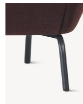
Black/White steel legs Standard